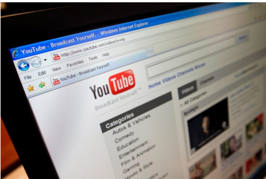
Advertisers have been boycotting YouTube out of concerns ads could appear alongside inappropriate content.

In the US, brands such as Starbucks, Walmart and Pepsi have pulled ads from YouTube. In Australia Holden , Telstra and even the federal government have done the same.